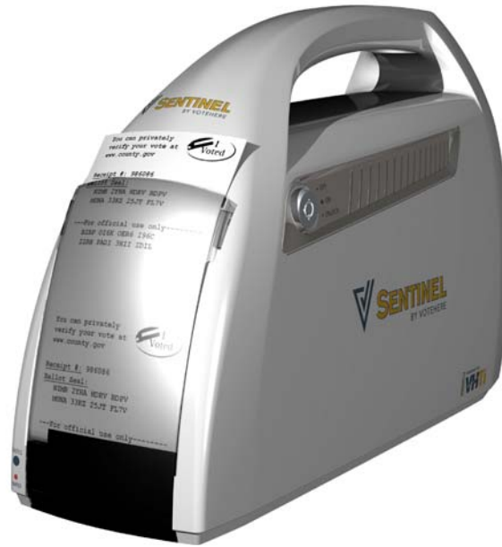
VoteHere's Sentinel verification module.

home, so that he can later check that a copy of his encrypted ballot is listed on the web site. In the voting booth, the encrypted ballot is partially opened to convince the voter that it indeed represents his intended vote.