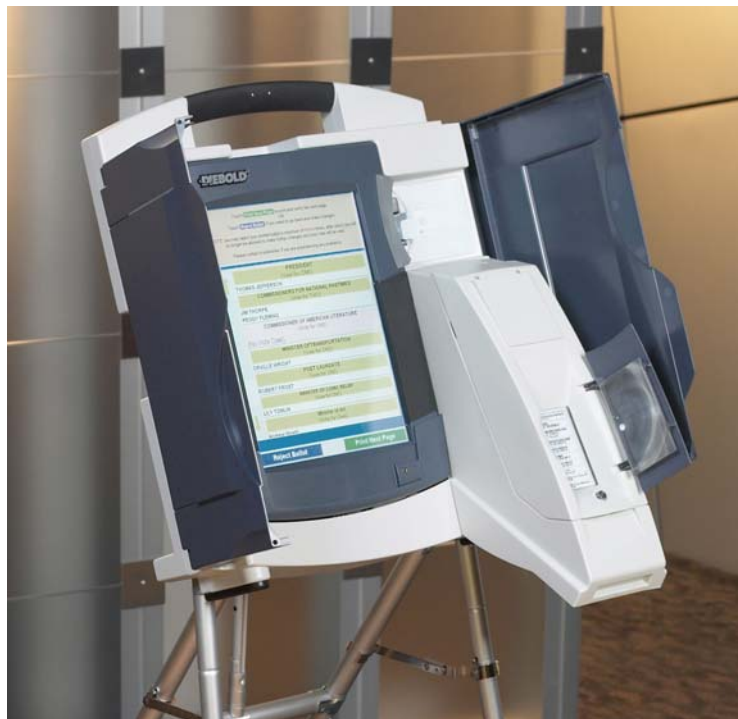
Equipment shown is Diebold's AccuVote TSX with printer, not the AccuVote TS that is used in Maryland (provided by Diebold).

The Diebold voter verifiable paper audit trail option (VVPAT) consists of a small printer encased in a sealed take-up unit housing that attaches to the side of the DRE (see Figure 3). The take-up unit housing has a glass front or screen approximately 2 inches by 4 inches. At the beginning of the election, a new spool of paper is loaded into the printer, and the printer unit is physically locked. The printer receives a direct feed from the DRE through an integrated serial databus (RS232) port.