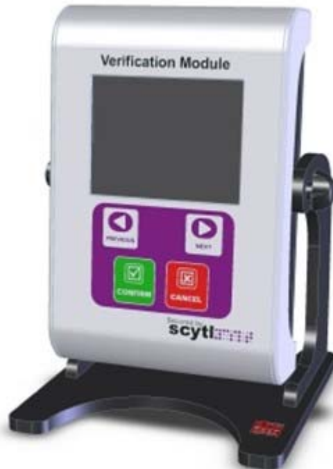
SCYTL's Pynx.DRE verification module (provided by SCYTL).

cryptographic protocol that protects the confirmed votes and fulfils the basic security requirements for electoral processes; that is, integrity of the results and voter privacy.